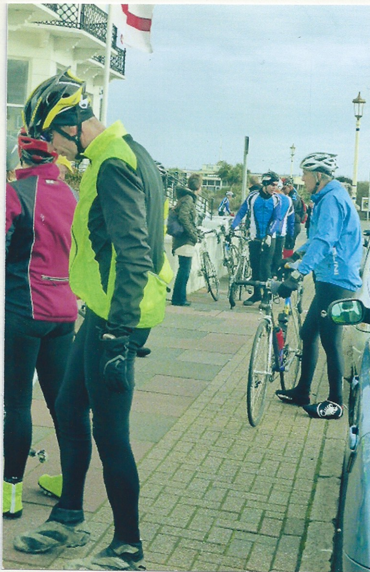
EASTBOURNE RIDE FEBRUARY 2014.