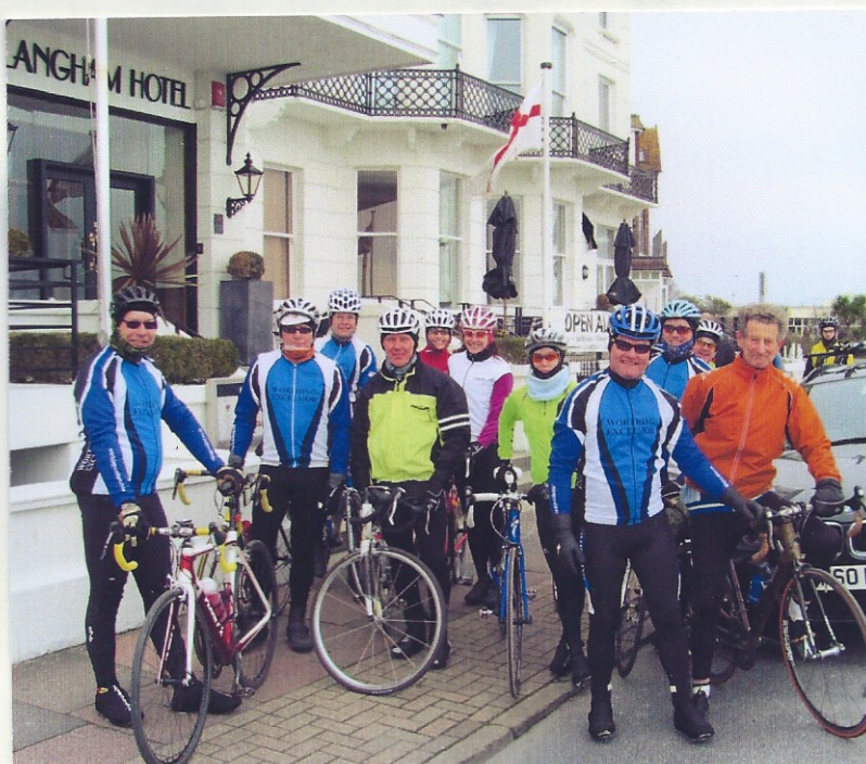
THE START OF THE RIDE HOME