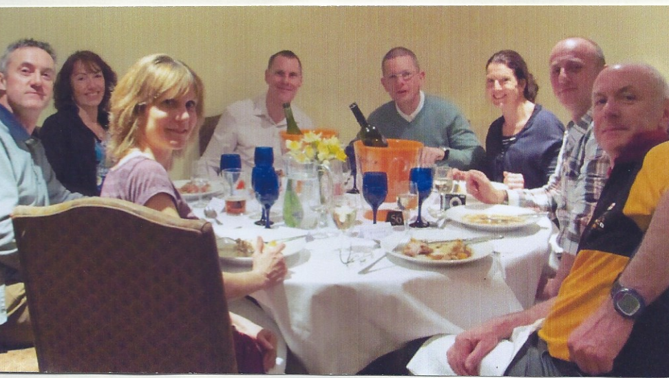
ONE OF THE DINNER TABLES - LANGHAM HOTEL