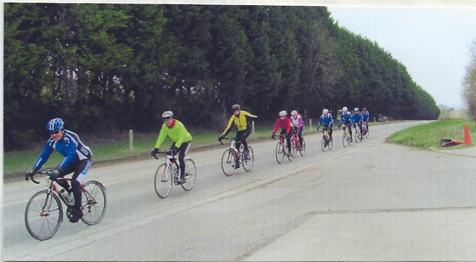
OVER GOLDING BARN - EASTBOURNE - OUTWARD TRIP